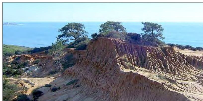
View from Broken Hill overlook

North fork 1 1/4 miles South fork 1 1/3 miles Reserve's longest trail, including access to the beach. Features chaparral, few trees, and scenic overlook pictured below.